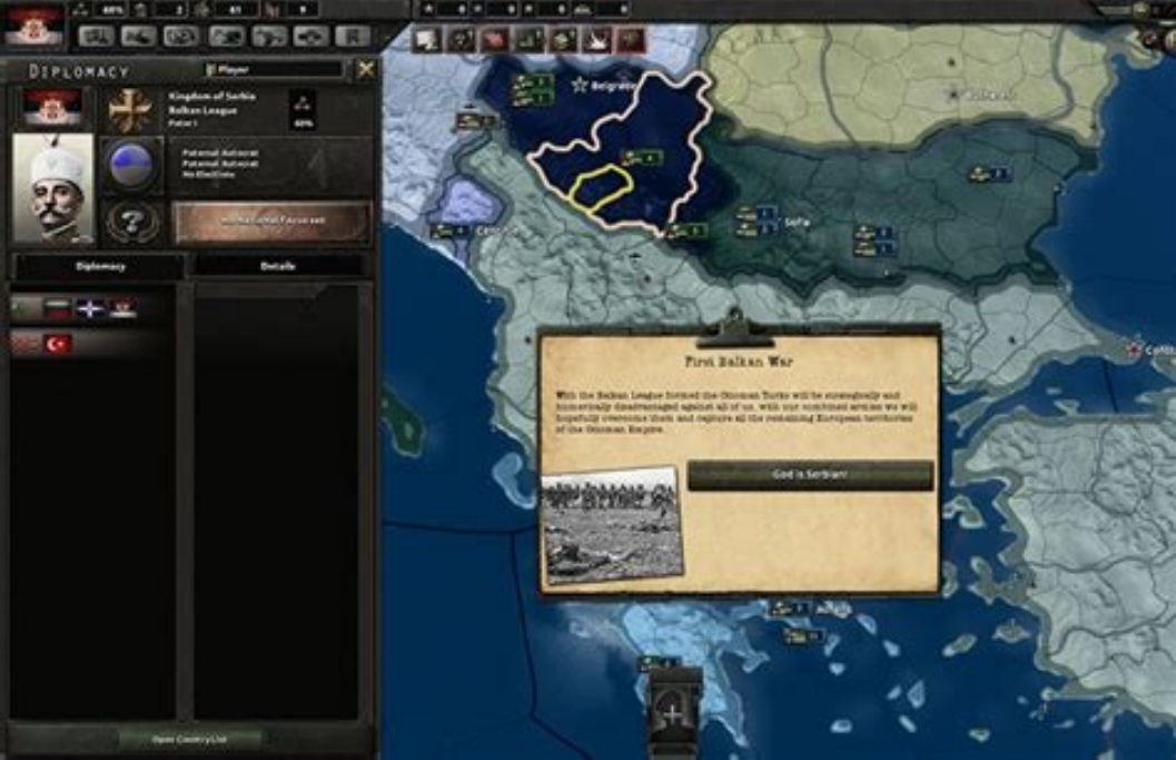
HoI4 best multiplayer mods. How to play manchukuo hoi4. Hoi4 best multiplayer nations. Hoi4 multiplayer rules.